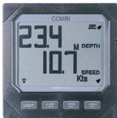
IS12 COMBI LOCH-SONDEUR TEMP MER