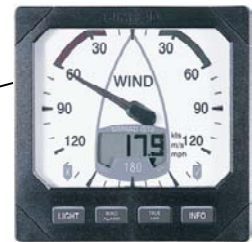
IS12 WIND VITESSE ANGLE VENT APP/REEL