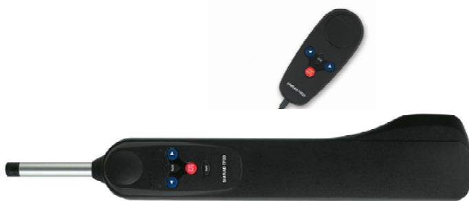
PILOTE AUTOMATIQUE TP22 + TELECOMMANDE HR22 MODE COMPAS - VENT